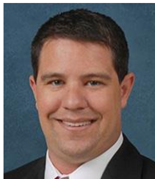
Sen Travis Hutson