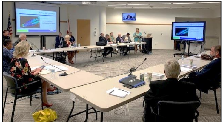
Council members & staff address infrastructure

The idea of a sales tax referendum in which revenue would be applied to infrastructure was also discussed. Consensus was that if it is brought back, then it must be better communicated to the voters. The 2019 referendum had mixed messages which led voters to oppose it. If it's brought back, it must be led by a citizens' coalition.